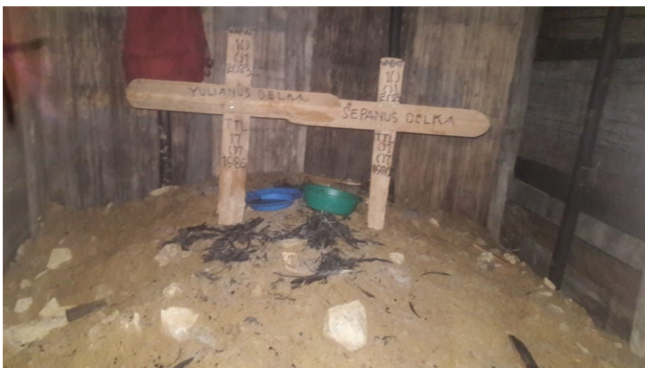
Figure 14: Graves attributed to individuals who died since 10 October 2021

of Indonesia military attacks or as a result of being driven from their homes. Of