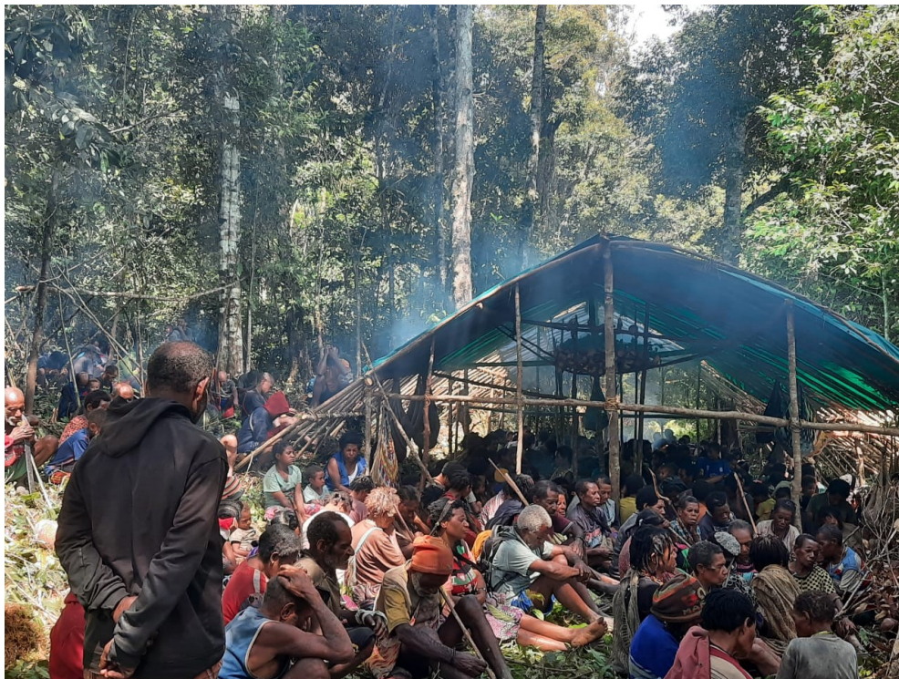
Figure 9: Ngalum people in a temporary camp after fleeing from attacks October 2021

being built, it was reportedly raining. At the altitudes where the people sought refuge, there was little nutrition and edible food. The forests in which refuge was sought are extremely wet.