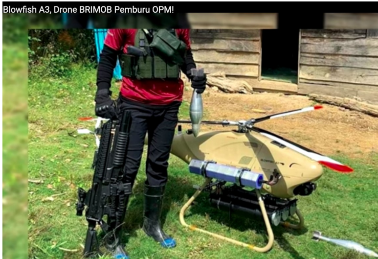
Figure 13: Image from video relating Brimob usage of Blowfish UAV in Ilaga, Papua https://www.youtube.com/watch?v=2MfGI-HI6sE post dated 18/08/2021