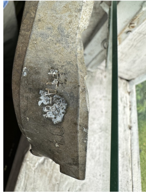
Figure 8: Sample of rocket winglet, from shrapnel in Tumolbil, Jamieson 29 April 2023