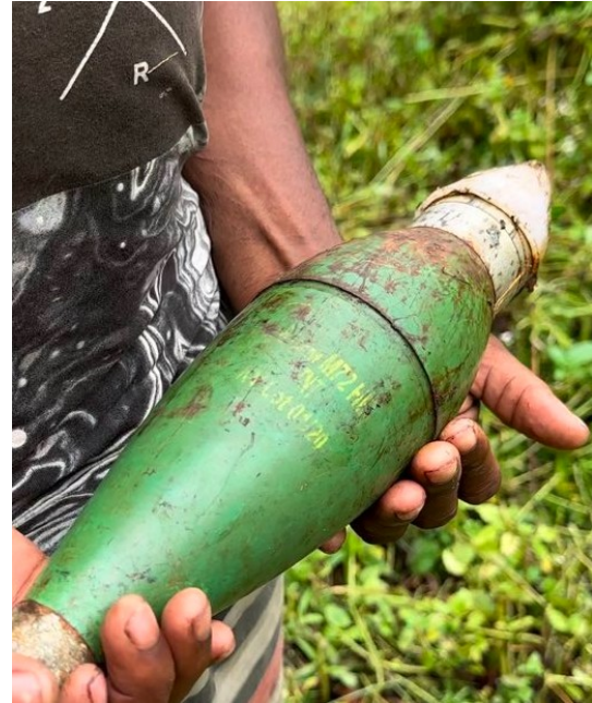
Figure 6: Modified Krusik mortar from Tumolbil, Langker 28 April 2023