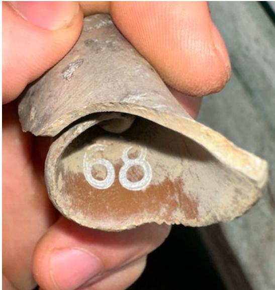
Figure 7: Shrapnel piece from Tumolbil, fuselage FZ 68 rocket, Jamieson 29 April 2023