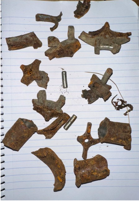
Figure 5: Shrapnel samples from Tumolbil including rocket winglet mountings, Jamieson 29 April 2023.