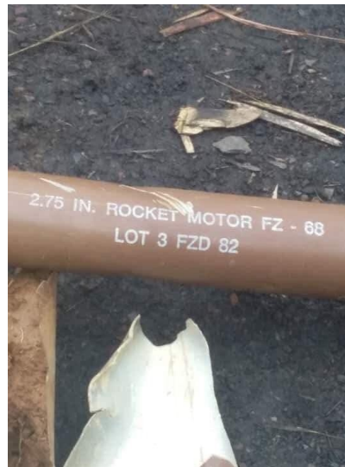
Figure 11: Same FZ68 rocket and shrapnel from helicopter attack on 3 January 2020, Ugimbe Village Intan Jaya, Papua