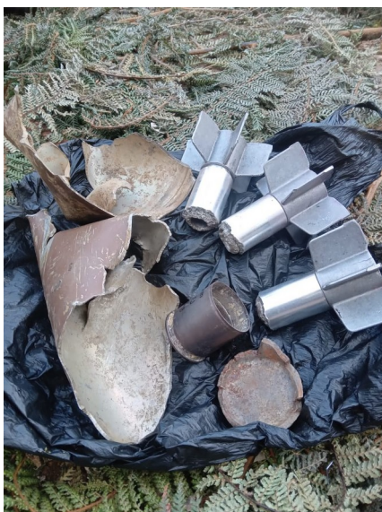
Figure 2: Rocket fuselage and diaphragm, mortar tails and spent HE grenade shell casing collected from attack site in villages near Kiwirok, October 2021

1. The Ngalum Kupel people, a distinct linguistic ethnic group, are the customary owners of the highland mountain valleys, on tributaries of the Sepik River, adjacent to Kiwirok in the Pengunang Bintang (Star Mountains) region of Papua, Indonesia (West Papua). The Ngalum Kupel people have a subsistence economy based on rotational slash and burn food gardens, animal production of pigs and chickens, combined with hunting and gathering of wild foods and medicines in montane, forest slopes and riverine estates. The Ngalum Kupel people share close customary and linguistic affiliation to Min peoples living around Tumolbil in Papua New Guinea (PNG). The villages of the Ngalum Kupel are located North and across the valley from the Indonesian administrative centre and military base of Kiwirok in the Pengunang Bintang region of Papua (West Papua). These villages are in proximity to the PNG/ Indonesian border.