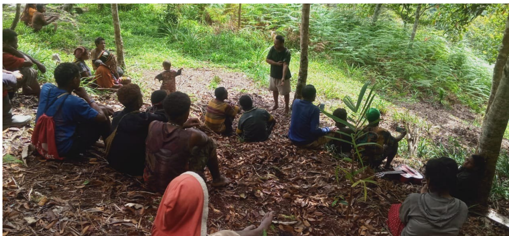
Figure 15: Ngalum people in the forest in 2023