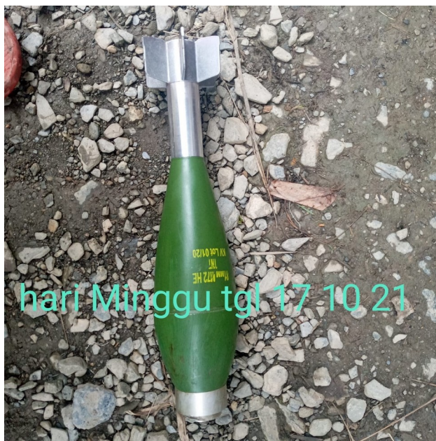
Figure 12: Modified Krusik Mortar collected from Kiwirok attack site dated 17 October 2021