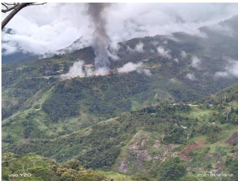
Figure 3: Photograph of military attack, 12 October 2021