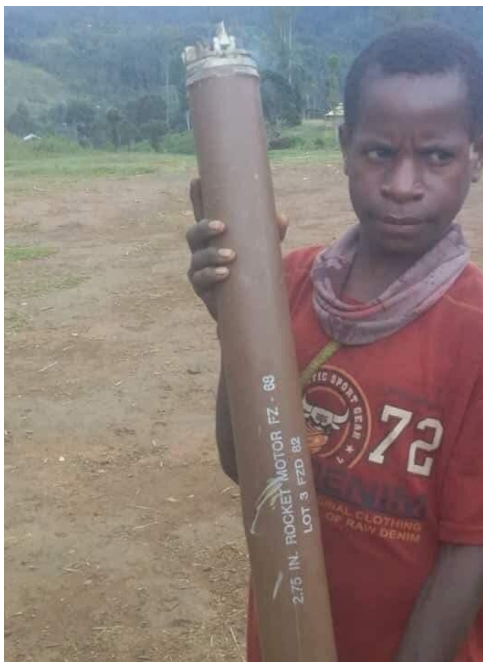
Figure 10: Local child pictured holding a FZ68 rocket from helicopter attack on 3 January 2020, Ugimbe Village Intan Jaya Papua