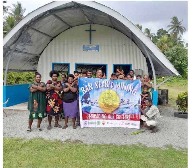
ASW Manus during one of the Awareness programs at Rambutso Island .