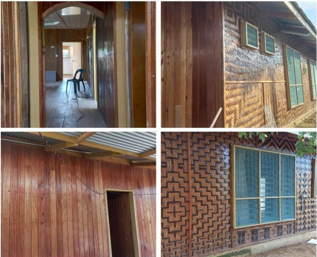
Photos of building and setting up the WCDF.