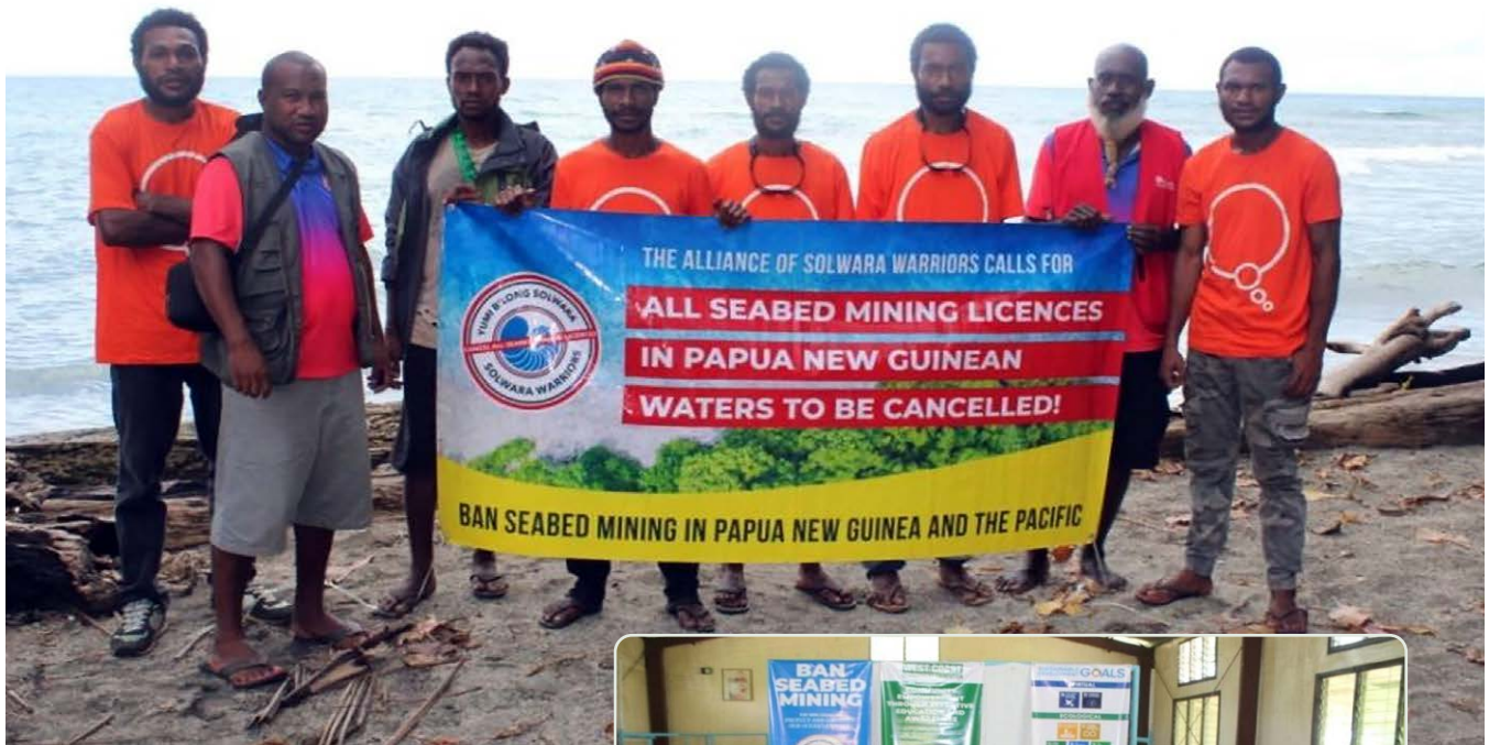
Students supporting the Ban Seabed Mining campaign at Labur (above) and University of Natural Resources and Environment (UNRE) Students during the SDG training with WCDF (right).