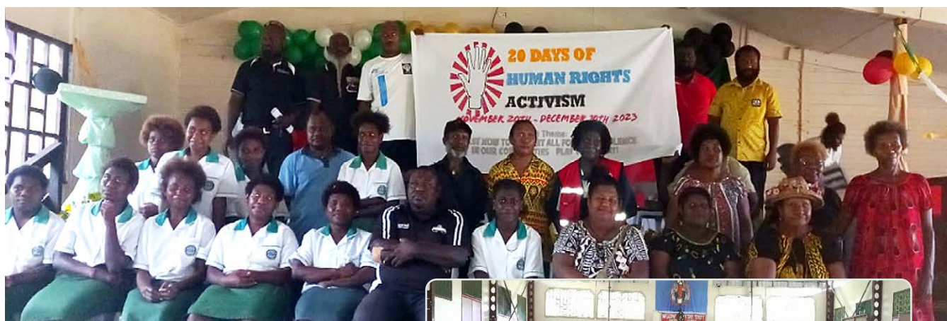
Launching of the 20 Days of Human Rights Activism in New Ireland (above) and the closing program (right).