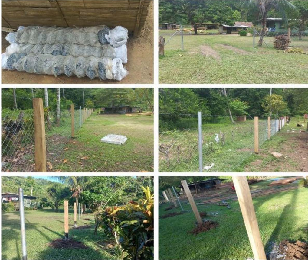
Photos of fencing.