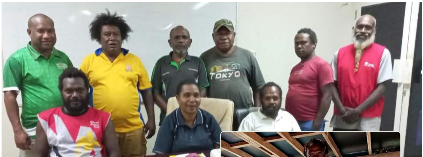
WCDF meeting with Lihir Landowners Association (above) and discussion with Natitua ILG executives of Tumudar, Big Tabar (right).