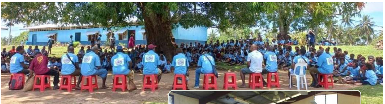
ASW visit to St Martins Primary School (above) and ASW Strategic meeting (right).