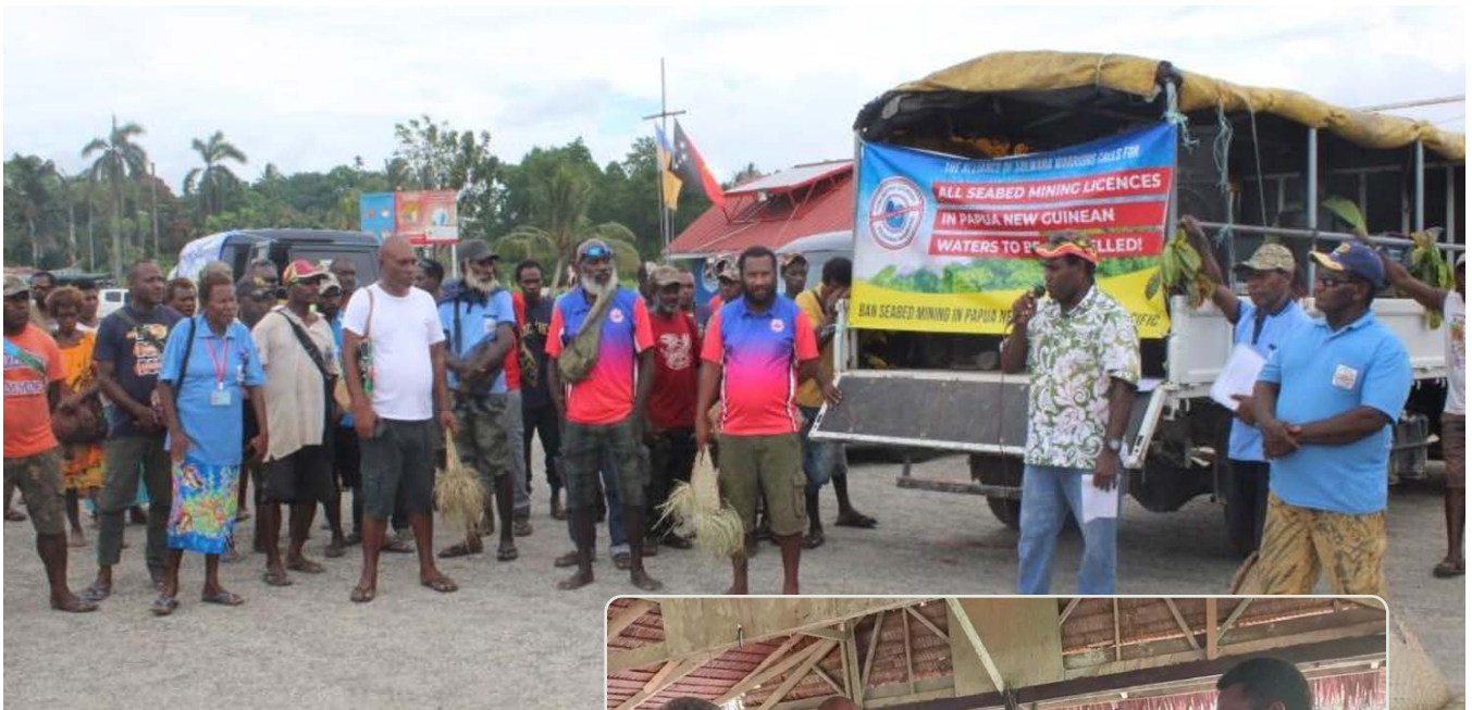
The petition received by Namatanai LLG President at the Namatanai Forum (above) and First Secretary to the Governor receiving the petition at the Kavieng Forum (right).