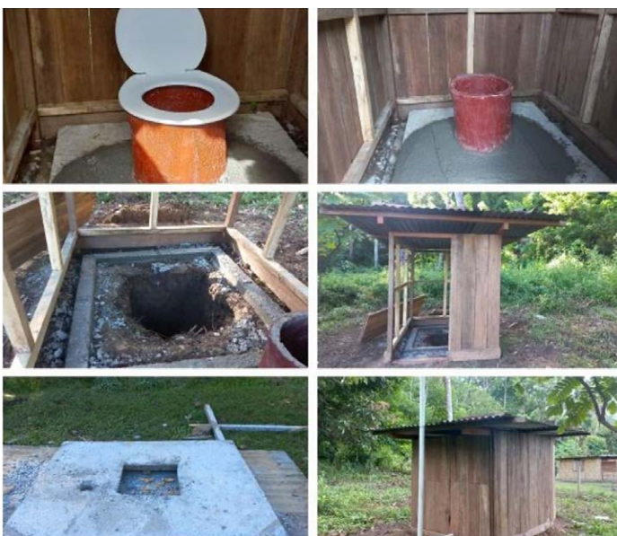
Photos of VIP toilet.