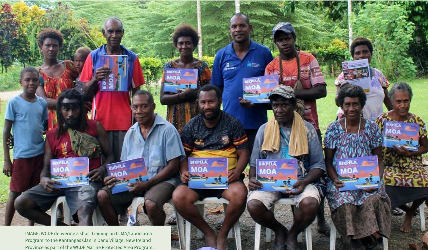
IMAGE: WCDF delivering a short training on LLMA/taboo area Program to the Kantangas Clan in Danu Village, New Ireland Province as part of the WCDF Marine Protected Area Program.

The West Coast Development Foundation (WCDF) believes in teamwork, valued partnerships, and community participation and engagement to achieve the most desired outcomes for our people. WCDF has a proven record of commitment to advocating in the interests of our people despite minimal funds to operate. WCDF is proud to stand with our communities in advocating a future based on our Melanesian ways to protect our cultures, customs, lands and seas.