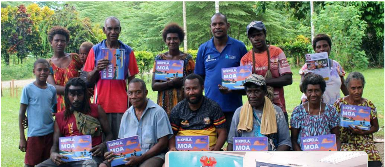
Delivering a short training on LLMA Programs to Kantangas Clan in Danu Village (above) and Meeting with Staff of the Ocean Affairs Office in Port Moresby (right).