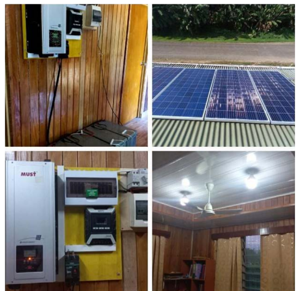
Photos of power box and solar set up.