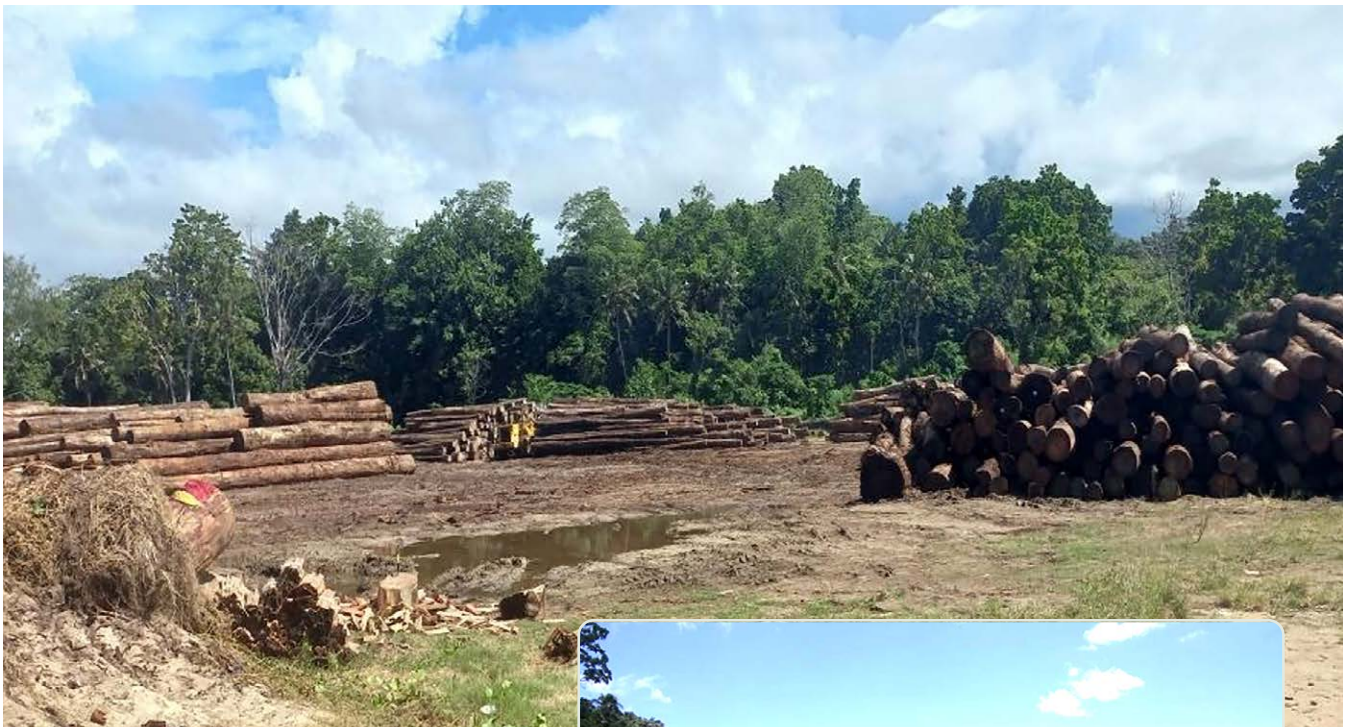
Logging camp at Nayaima (above) and the logging camp at Konos (right).