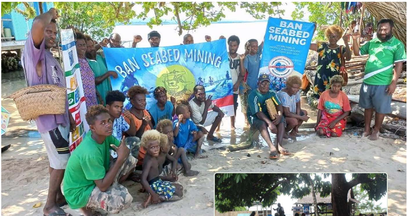
Photos of community awareness at Upuas Community Ward, Ward 1 Tikana LLG (above) and Tembin Community Ward 20 Sentral Niu Ailan LLG (right).