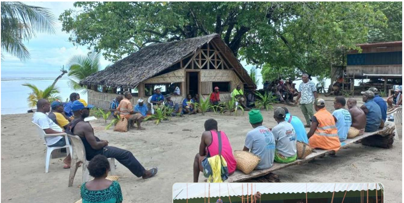
Customary program held at Konogogo (above) and meeting with Kono Shark Callers (right).