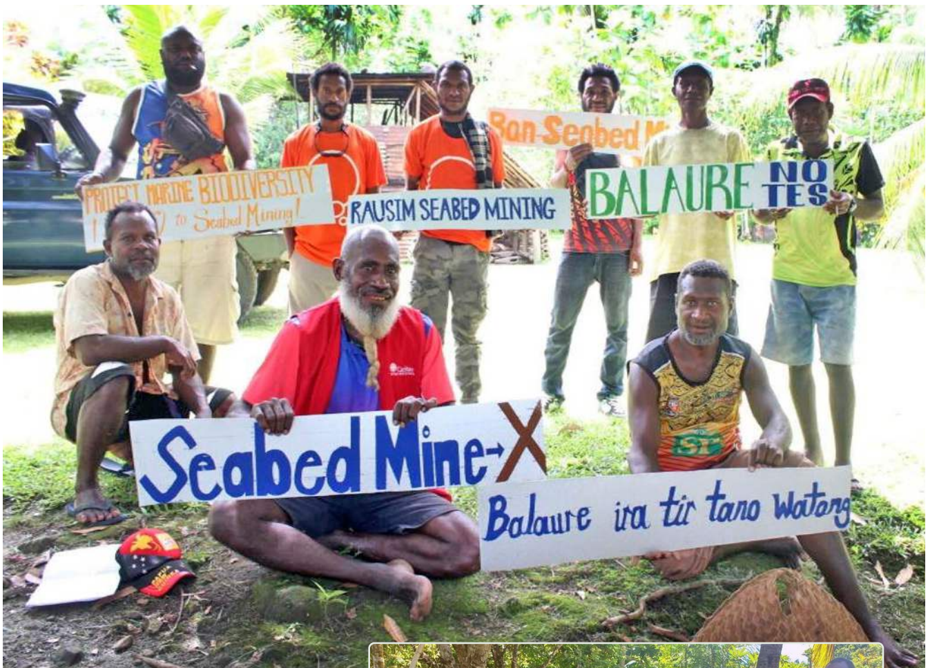
Photos taken on the 25th of January and 28th of November. The warden hearing was cancelled due to unknown reasons.