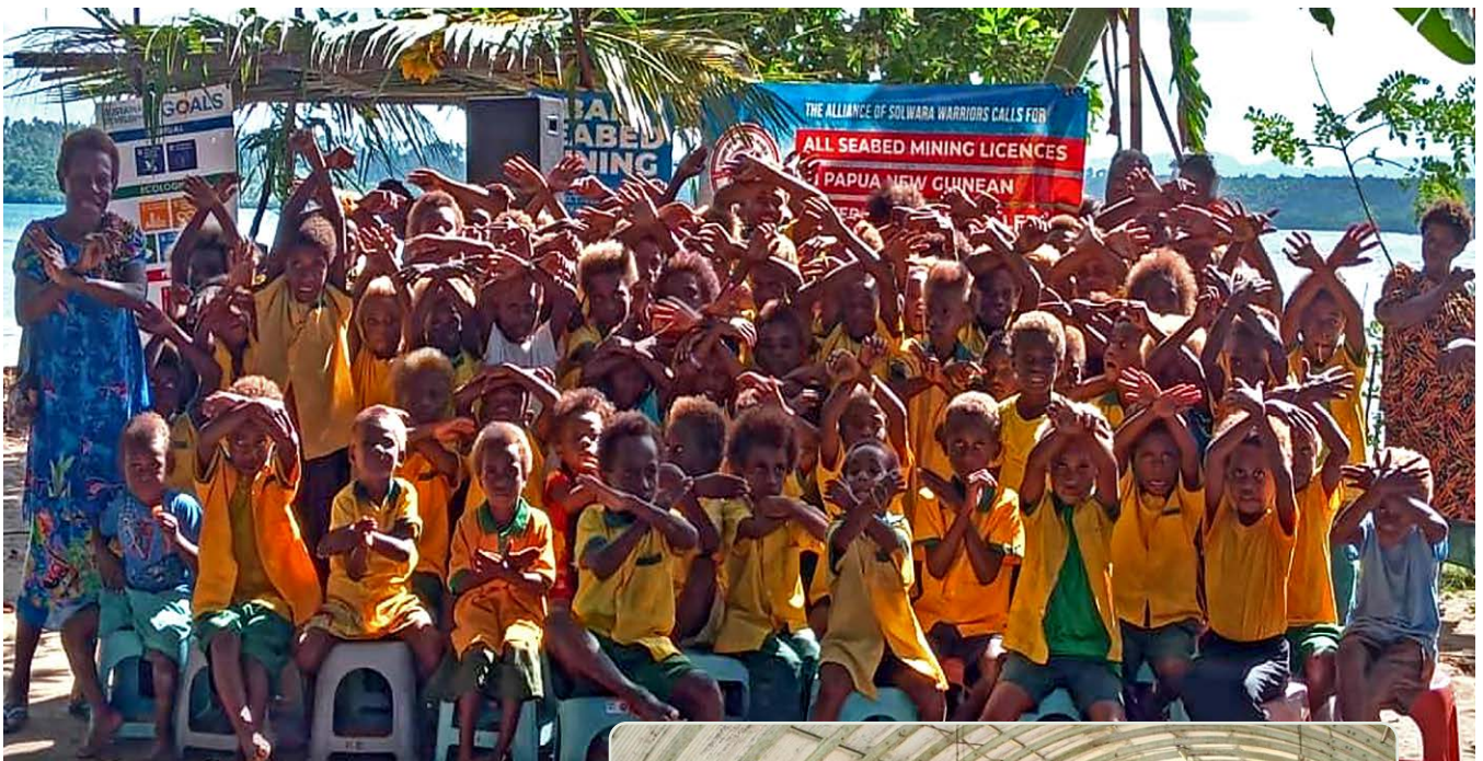
Awareness was conducted at Moiko Palpal Elementary School (above) and Mongop Secondary School (right).