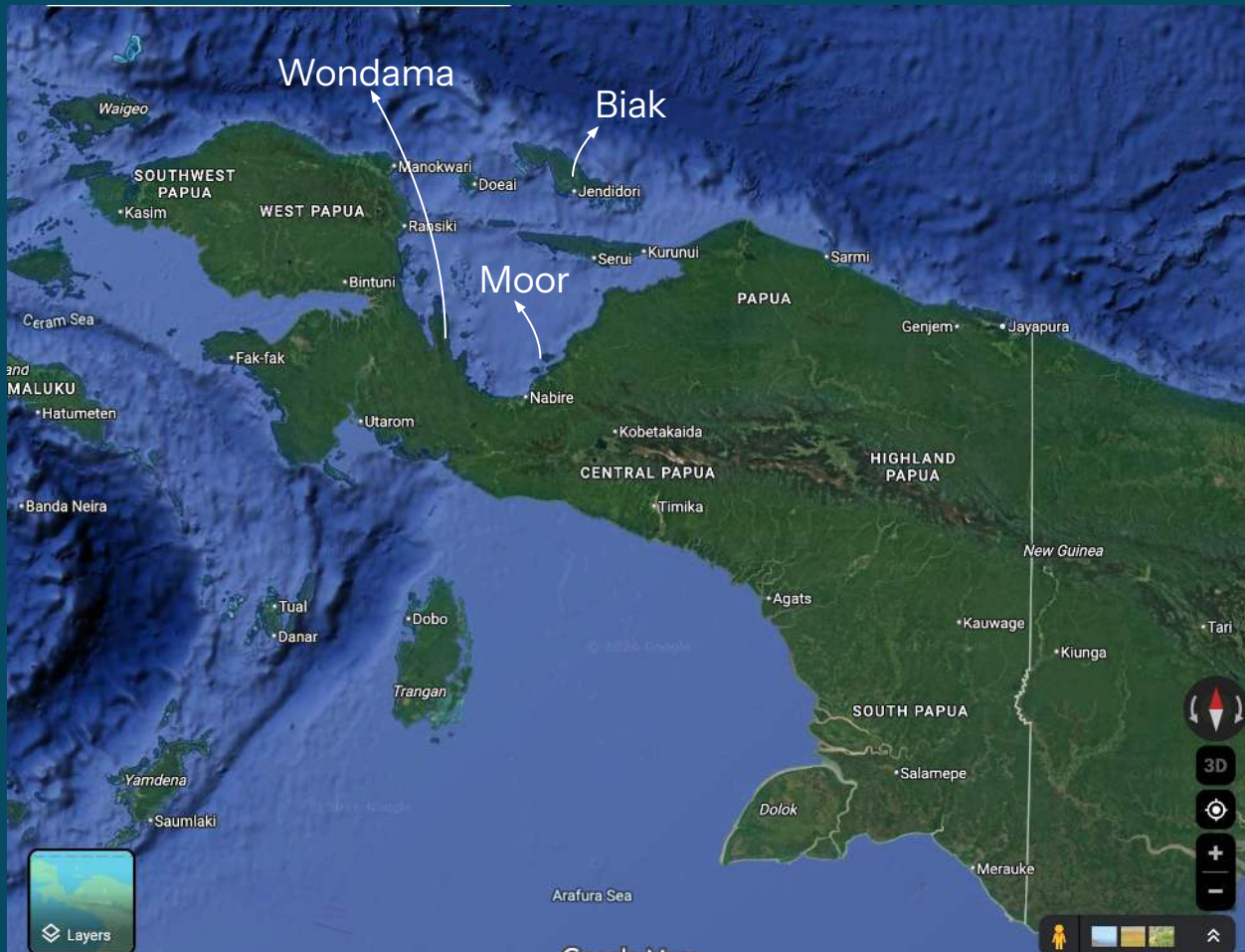
Map of Papua